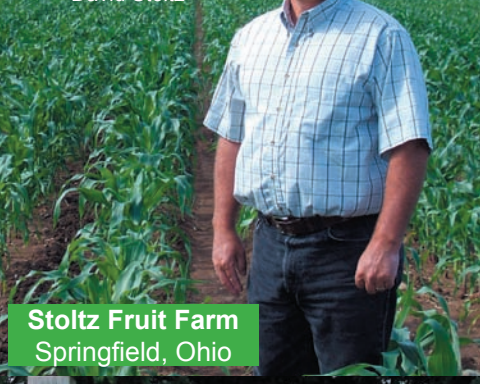
Stoltz Fruit Farm